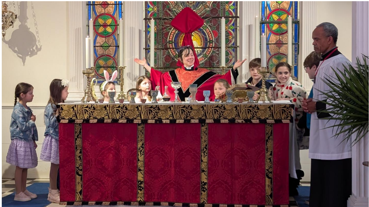
Palm Sunday at Christ Church