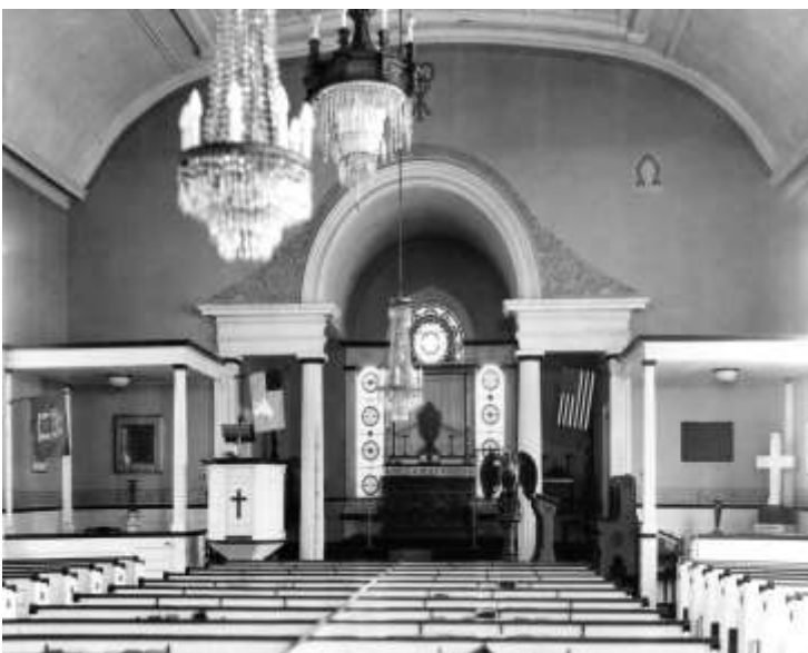
INTERIOR IN THE 1920s

1924-1925 – A Colonial Restoration moved the Baptismal font to the rear of the sanctuary, included the installation of a high pulpit, and used lighter toned colors. A slate roof was put on and the exterior was again painted white covering an earlier putty color.