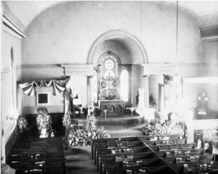
INTERIOR DECORATED FOR PRESIDENT GARFIELD'S DEATH

1882 – A new set of chancel furnishings were provided including a carved altar of butternut wood, bronze communion railings, eagle lectern, prayer stalls, a cut crystal chandelier, and a marble Baptismal font.