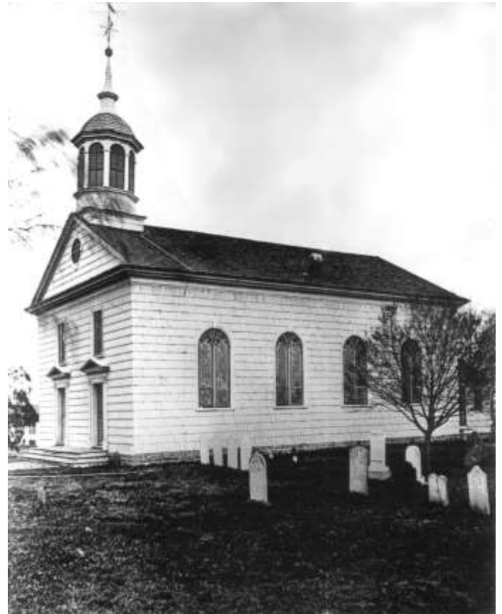
C 1869 BEFORE CLOCK TOWER BUT WITH STAINED GLASS

1867 – Stained glass windows installed in old sashed window openings. George DeHaert Gillespie donated the chancel Palladian window.