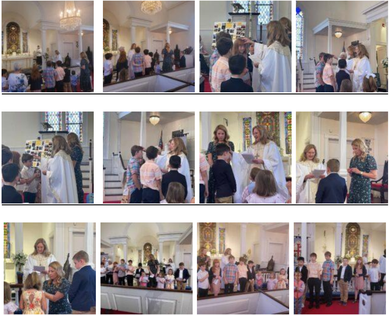
Communion Sunday, May 7, 2023

Summer Service Schedule begins June 17 Saturdays: outdoor service at 5:00 pm Sundays: in the church at 9:00 am