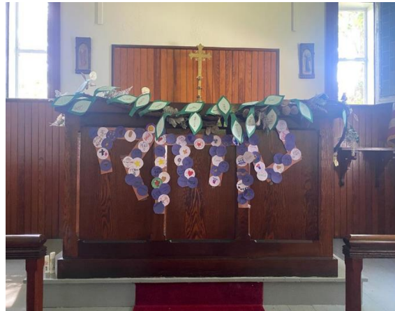
The Chapel: The Vine and the Branches