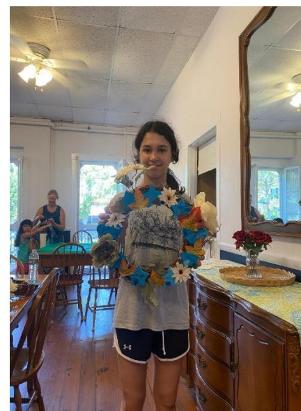
Displaying their Grapevine Wreaths