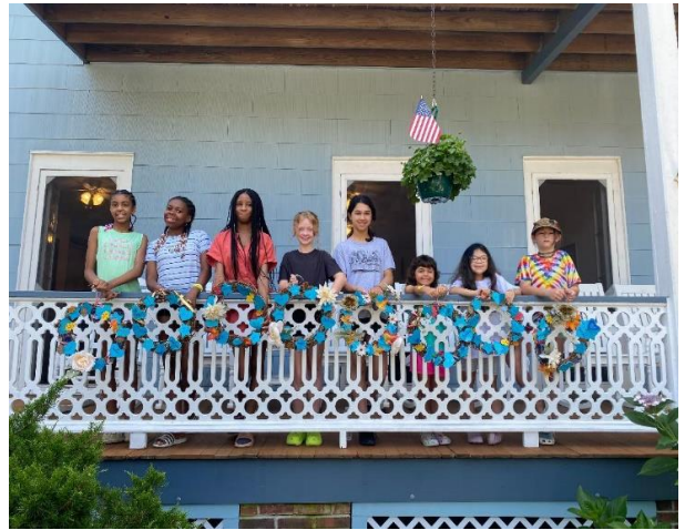
Holiday House Juniors