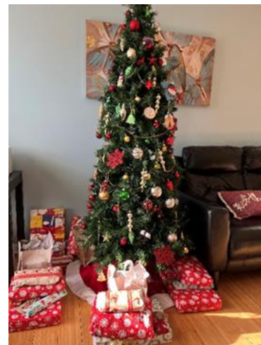
The tree at Covenant House